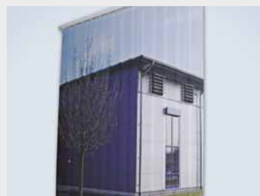
Vertical Blind louvres are suitable for digital printing as well.