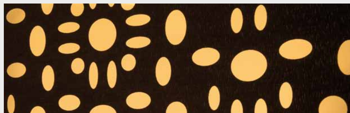
The cutting-out of individual designs is possible with fabrics from our Silent Gliss collections.