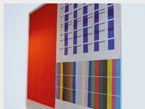
Holohebral printing – Fabrics can be printed over the entire surface with any kind of Pantone colour!